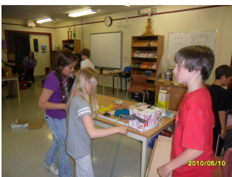
I wonder if I can get some more duct tape out of Michael?